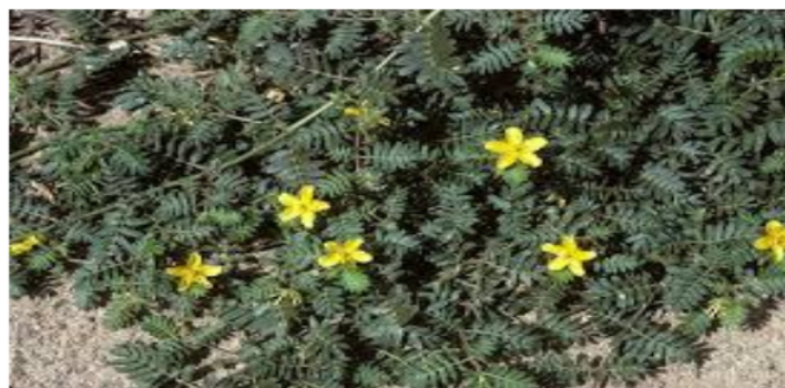
Figure 1: Tribulus terrestris cultivated in Iraq

The plant material was prepared from the Leaves of Tribulus terrestris as shown in Figure 1. They were collected from Al Zahwraa Park Iraq\ Baghdad and authenticated by Dr. Ibrahim Salih at the College of Pharmacy-Mustansiriyah University. The leaves were collected during October/ 2023 and dried under shade conditions at room temperature for 14 days before grinding commercial electric blender and weighing as a powder.